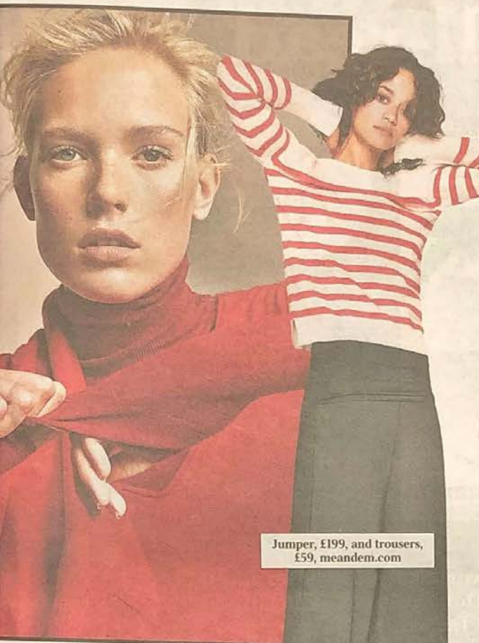
Jumper, £199, and trousers, £59, meandem.com